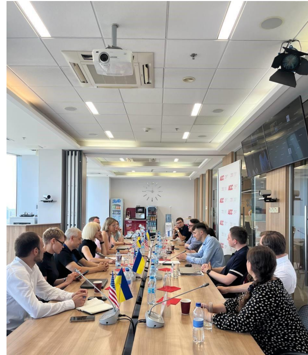
Meeting with the member companies of the AmCham Ukraine