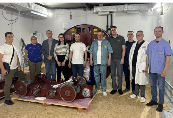
Cherkasy Regional Oncology Center

Last year, MPU completed a highly complex procurement of 15 state-of-the-art linear accelerators . The Sumy Regional Clinical Oncology Center was the first to receive this advanced equipment, valued at UAH 36 million each.