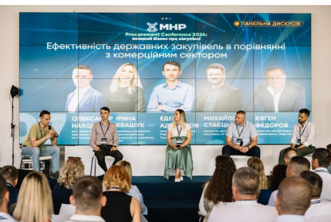
MHP Procurement Conference 2024