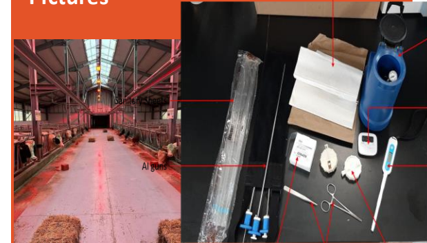
Sanitary covers Tweezers Straw-cutter